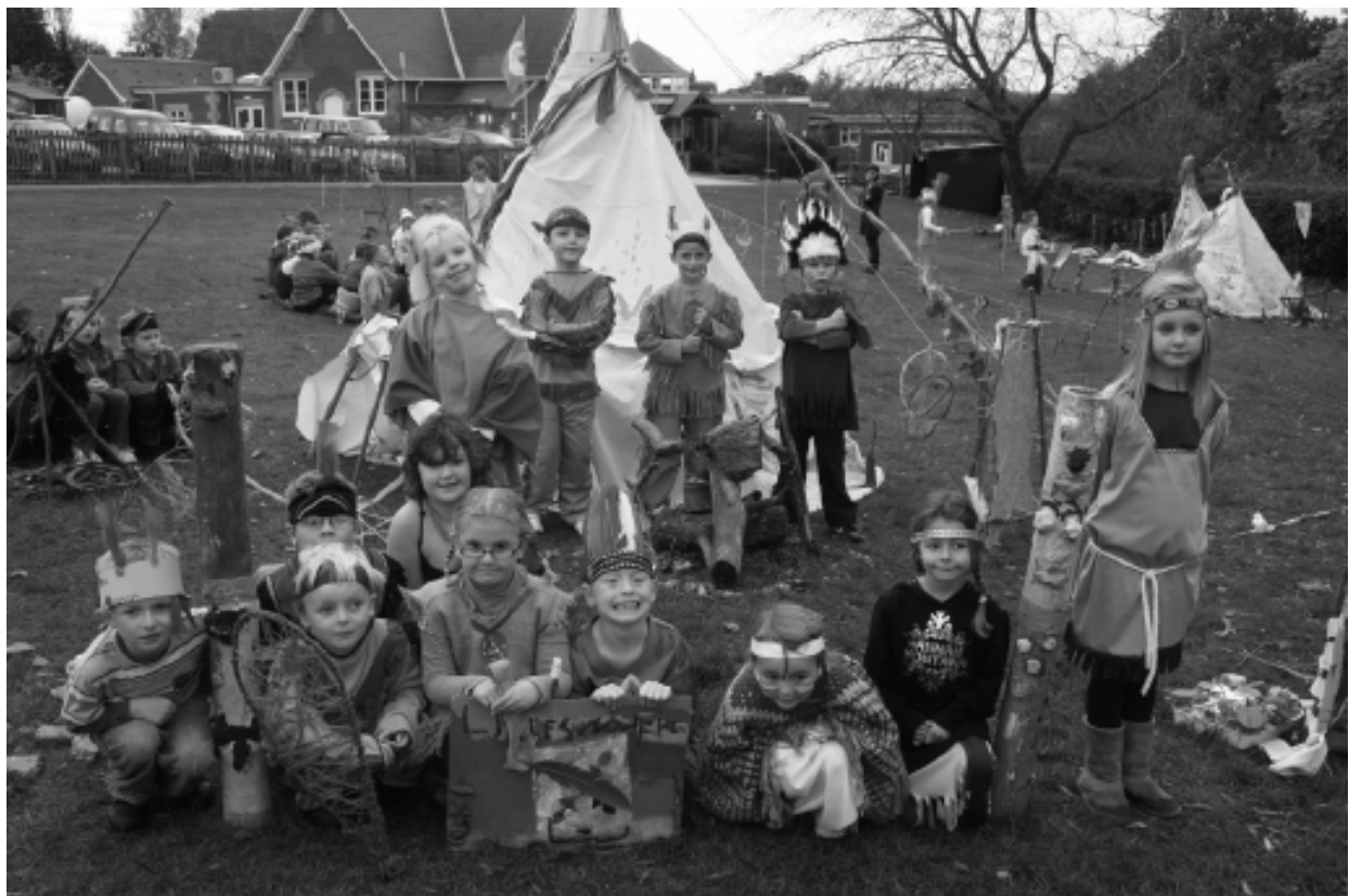
One of the twelve Indian Encampments – look-out for your scalps!